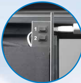
Program and test vend buttons accessed without having to open the coin box door.