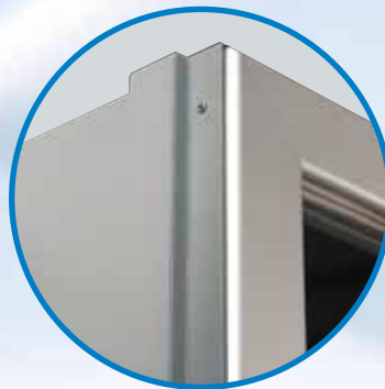
Anti-theft side and upper bars.