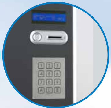
Selection buttons, coin insert, change giving in metal holder. Scrolling LCD display 2X20 blue.