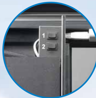
Program and test vend buttons accessed without having to open the coin box door.