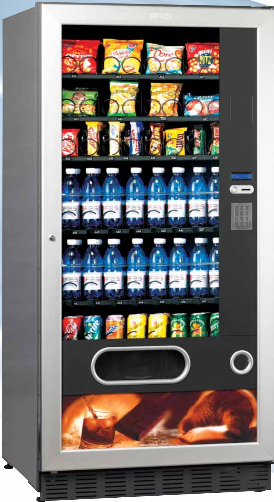
Fast 900 "R"