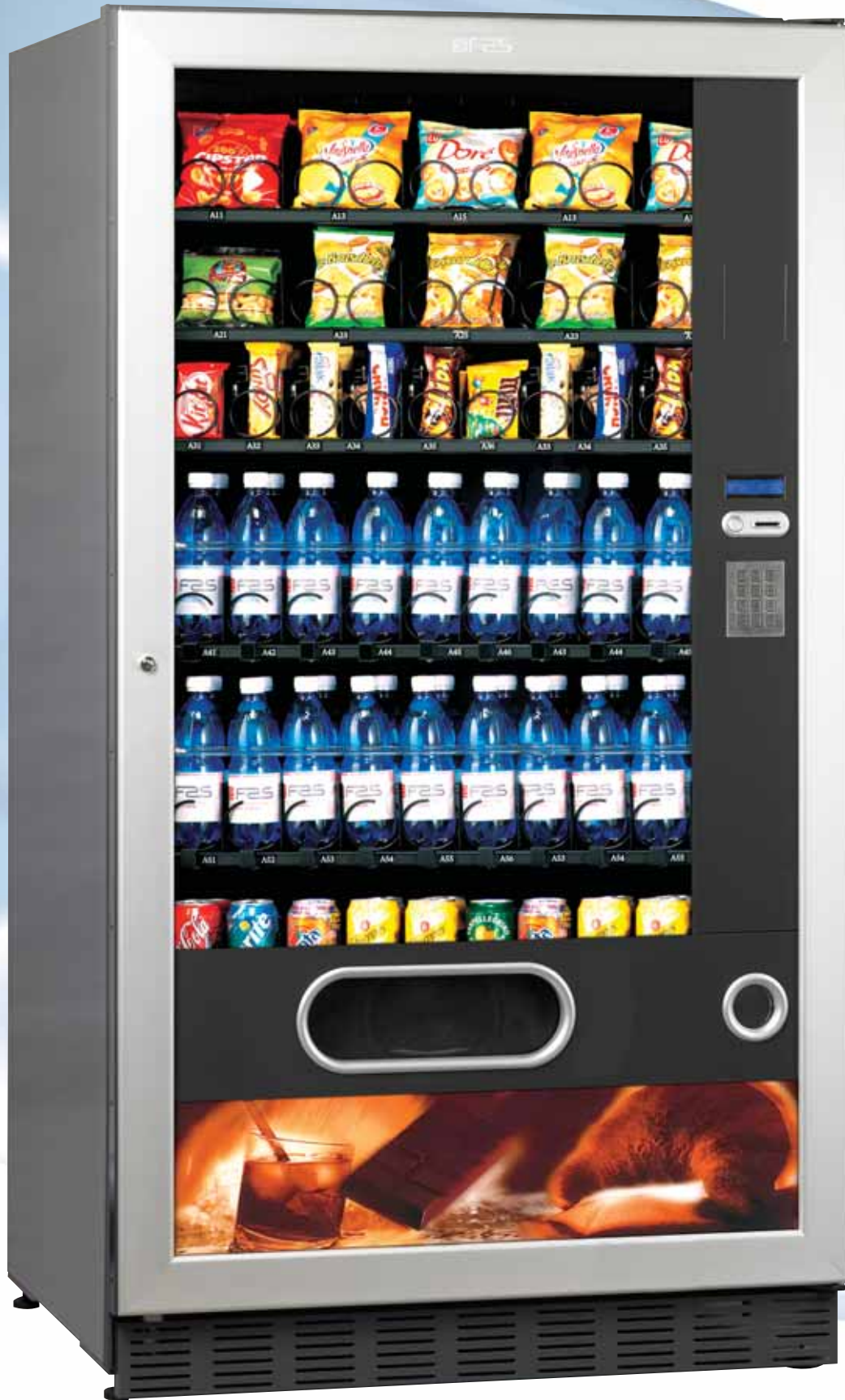
Fast 1050 "R"